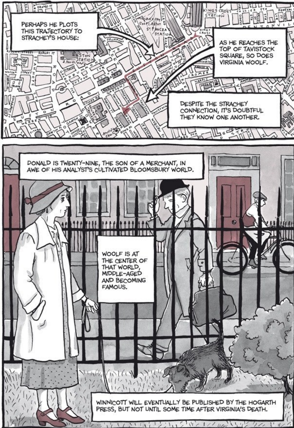
Figure 2. Are You My Mother? , p. 26.