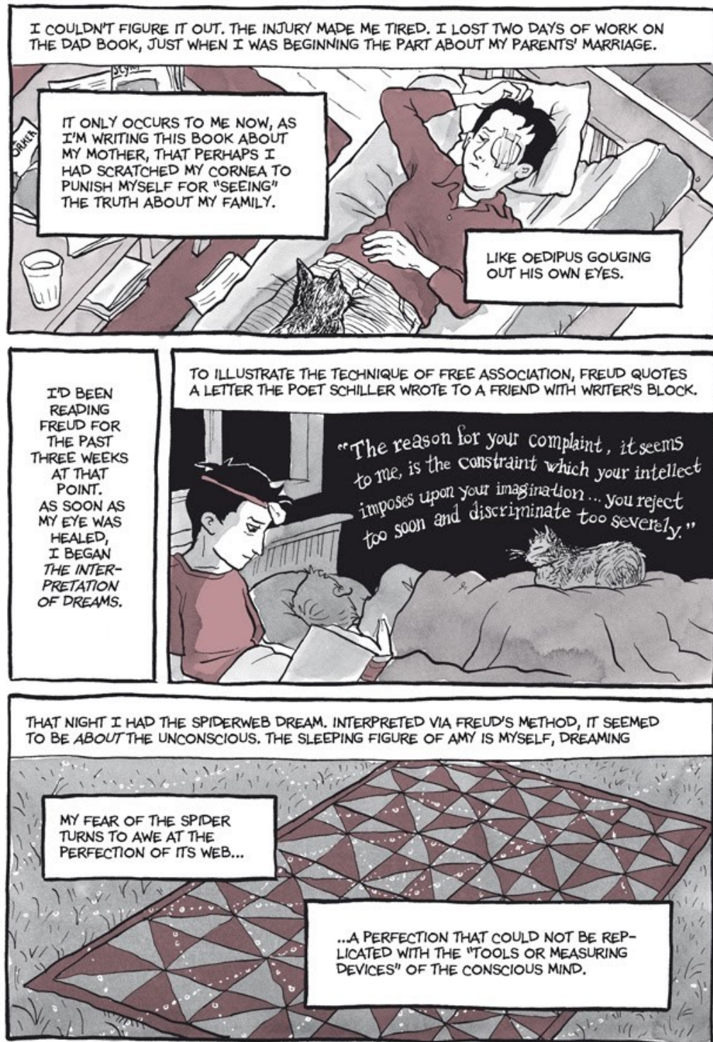
Figure 3. Are You My Mother?, p. 65.