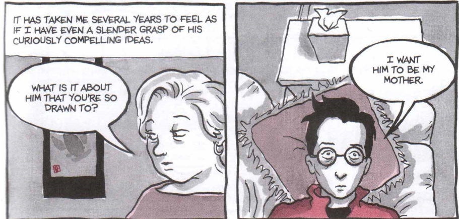
Figure 1. Are You My Mother? , p. 21.

Her two memoirs, Fun Home: A Family Tragicomic (2006) and Are You My Mother?: A Comic Drama (2012), catapulted Bechdel into the mainstream as her works have garnered her praise for documenting the pain of domestic drama, for her stunning art, and for giving a voice to lesbian identity. Her first memoir, Fun Home , was turned into a musical in 2013, won a Tony award for “Best Musical” and other categories in 2015, and is slated to be a feature film, too.